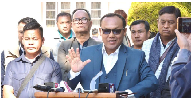
IT News Imphal, Dec 10: