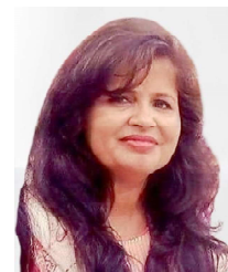
By: Mehjabin Bhanu

The various activities of the USA on human rights around the world can often be observed. The US publishes 'human rights situation report' on various countries of the world on the Human Rights Day (December 10). Sometimes, it imposes sanctions on some countries for human rights violation. But questions are being raised from various quarters, how much human rights are being protected in their own country who are so worried about human rights around the world?