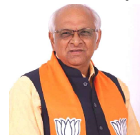
Pradesh chief minister.

Meanwhile, the newly elected Congress MLA's who met in Shimla on Friday have unanimously passed a resolution authorising party president Mallikarjun Kharge to pick the legislature party leader, who will be the next Himachal Pradesh chief minister.