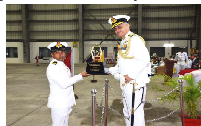
A Naval officer is being awarded a trophy at a function organised to mark the graduation of the 99th HCC, at NAS - "INS Rajali".

During the course, the trainee pilots are introduced to several nuances of helicopter flying. The pilots undergo a challenging syllabus which includes navigation, night flying, formation flying and Search and Rescue operations over sea. At the end of the course, the trainees are awarded for their performance.