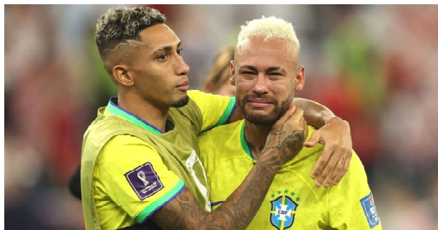
Neymar was in tears after the match.

The Croatia keeper was kept busy and stopped Neymar again in the 76th minute, and