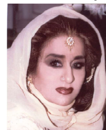
By: Shahnaz Husain

Winter weather can take a serious toll on our skin. The sudden influx of dry air and fierce, bitter winds can cause a number of issues like redness and bumps on the skin during the cold and blustery weather. Dry, cold air can set off redness in the cheeks, nose, chin and forehead, similar to facial flushing. Even when you moisturize, you can still get dry, itchy, red skin.